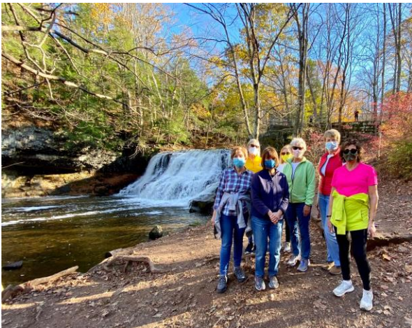
November Cultural Event: Middletown, CT WADSWORTH FALLS STATE PARK