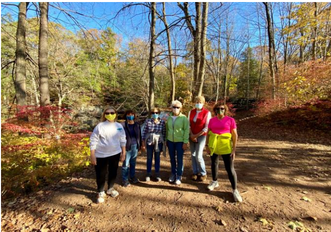
November Cultural Trip: Wadsworth Falls hike