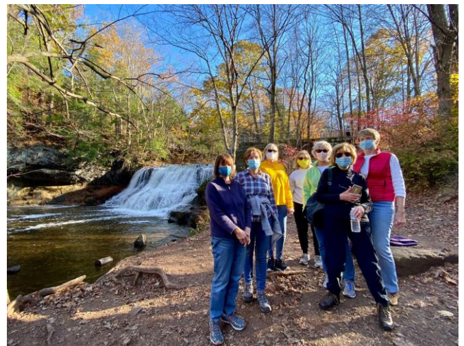
More Wadsworth park hikers