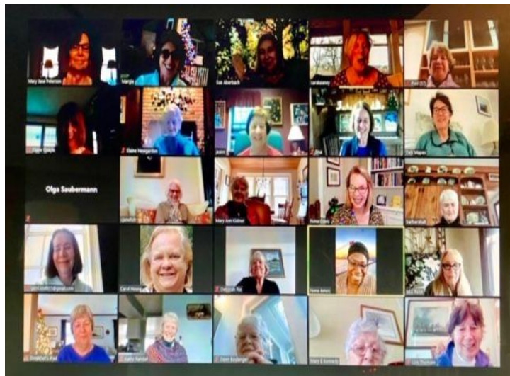
December 2 nd Event: Live Zoom with Authors M.J. Rose and Fiona Davis discussing Stories from Suffragette City with attending Members.