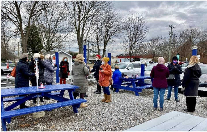
Dec. 9 th : Our Holiday Hot Chocolate Meet-Up at Johnny Ad's – Old Saybrook, CT.