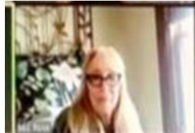
Author M.J. Rose