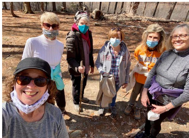
Members at our hike at Cockaponsett State Park in Chester