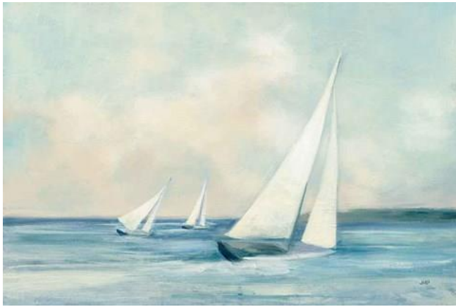
A MOST RELAXING SUMMER TO ALL!