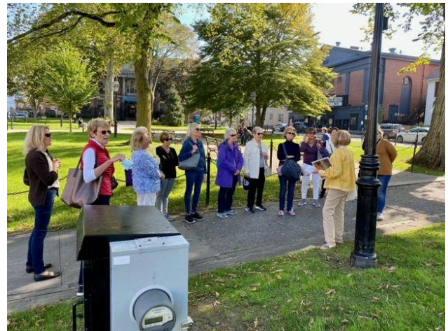
Members on Newport Historical Society’s tour “Discover Colonial Newport” in October.