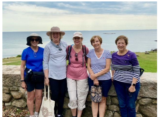
Members at the Rocky Neck State Park hike in October.