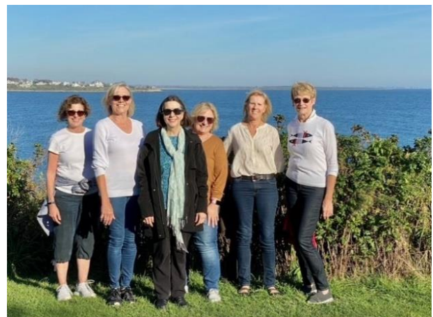
Members visiting Newport, RI, at October's Cultural Trip.