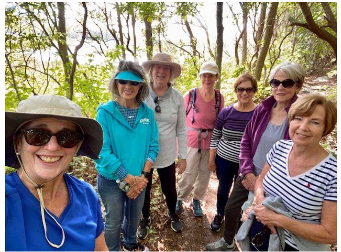
Members hiking at Rocky Neck State Park in October.