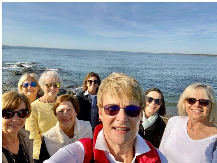
Members on the Newport, RI, shore during the October Cultural Trip.