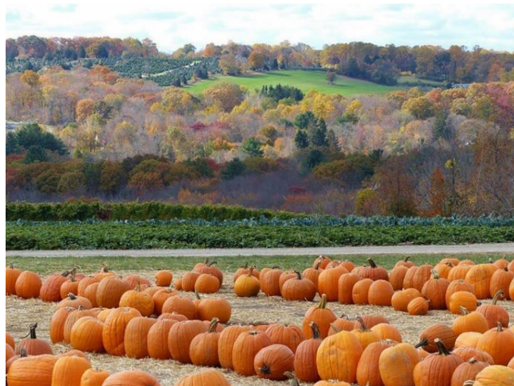
PUMPKINS at Jones Family Farm, Shelton, CT