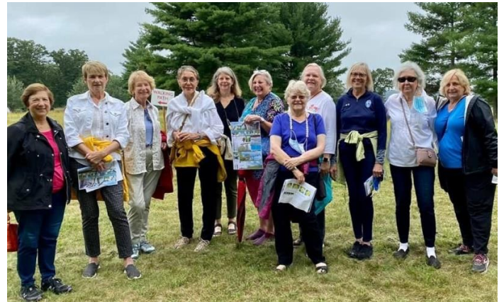
Sept. trip to Hogpen Hill Farms in Woodbury, CT, to view Edward Tufte’s abstract sculptures.