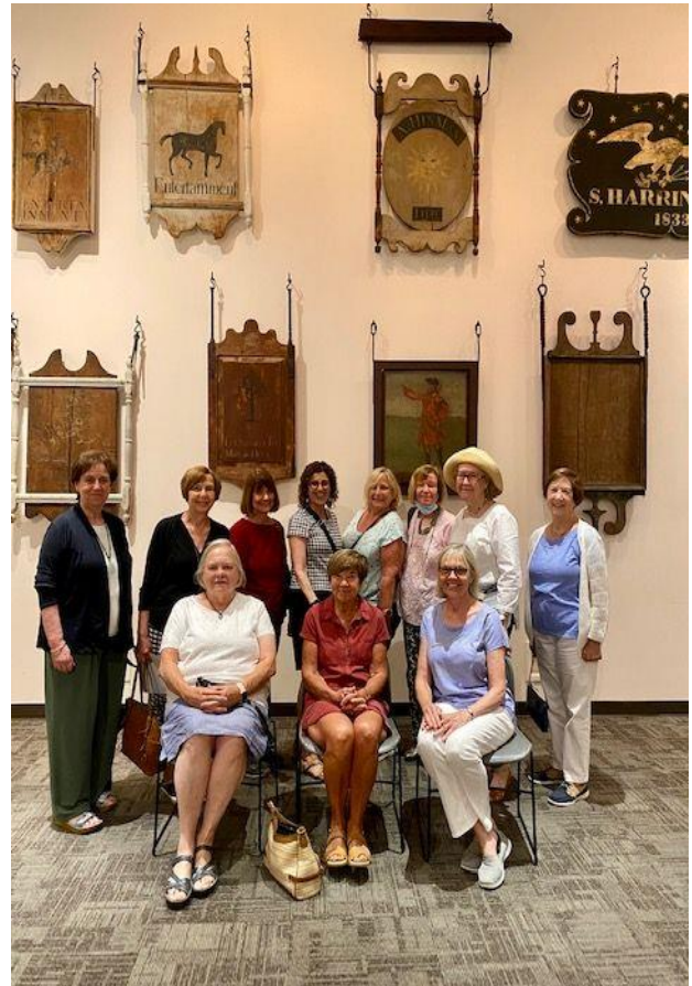
LVC Members' Cultural Trip to the CT Historical Society in Hartford, June 17, 2021.