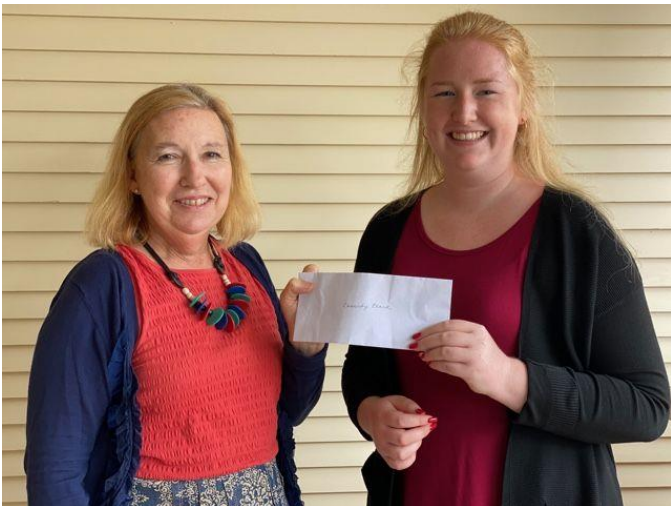
Co-Chair of the Scholarship Committee presenting one of our Grant Recipients, with her grant check.

The Scholarship Committee met in June to select the Educational Grant recipients for 2021. We are happy to announce that three women will receive the grants this year: