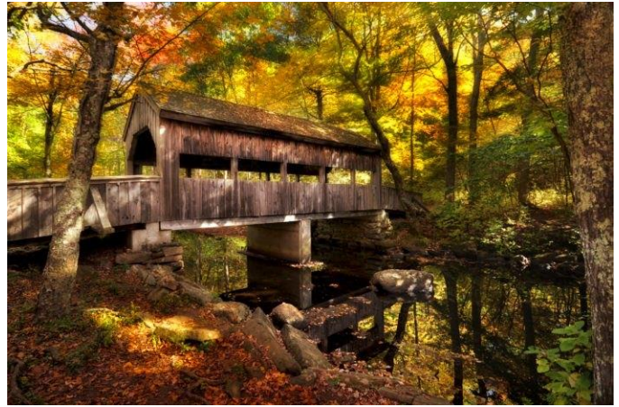
The Devil's Hopyard State Park's Covered Bridge - East Haddam, CT