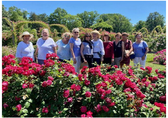
LCV Members' Cultural Trip to the Elizabeth Rose Garden in West Hartford, June 17, 2021.