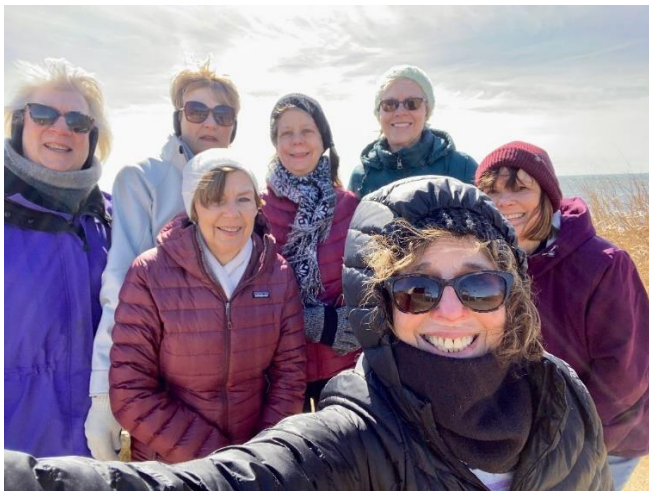
LCV Members on a recent hiking outing.