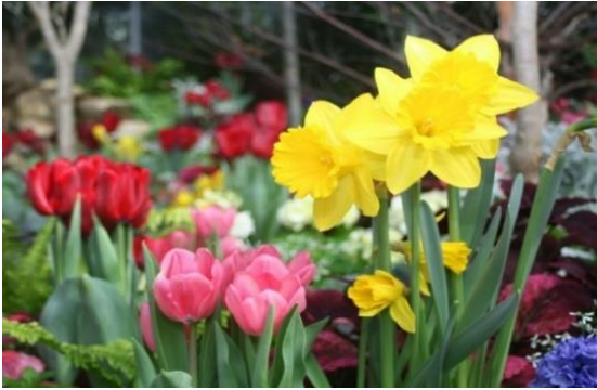
CT Flowers in April