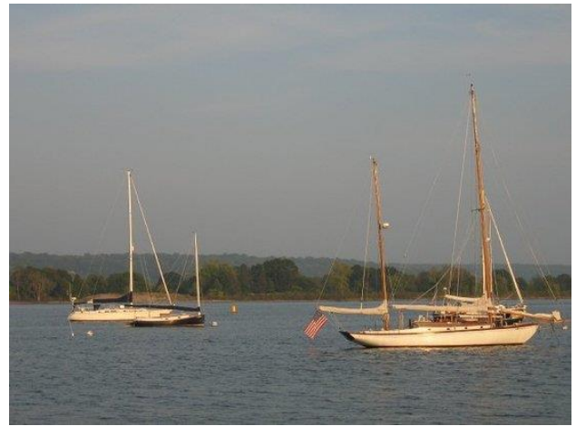
Essex, CT – Sailboats on the CT River