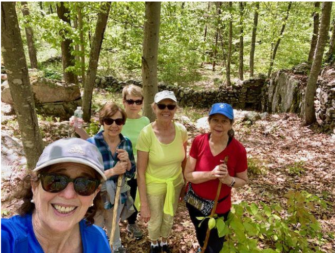
LCV members hiking the Heritage Trail in Hartman Park, Lyme, this May.