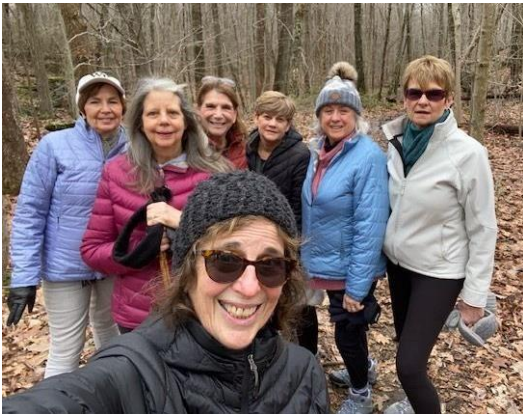
January Hike at Parmalee Farms in Killingworth.