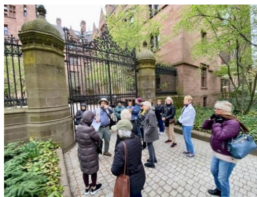
April Cultural Trip – Yale University Gargoyles