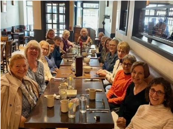
April Cultural Trip attendees enjoying a restaurant lunch.