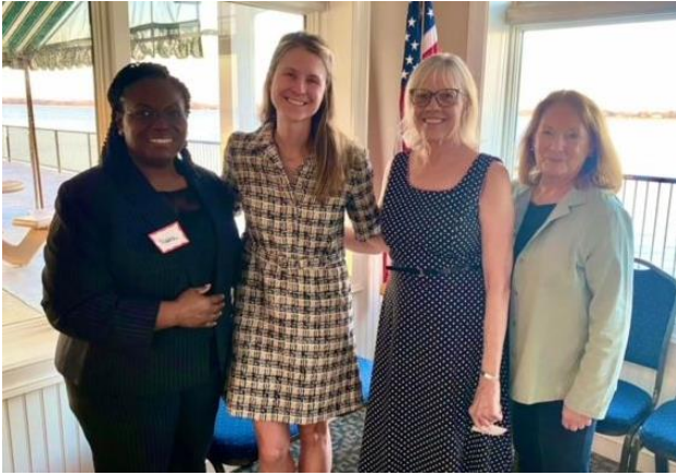
April's Annual Joint Meeting with LCV-AAUW Branch and the Shoreline AAUW Branch at the Pavillon at Saybrook .