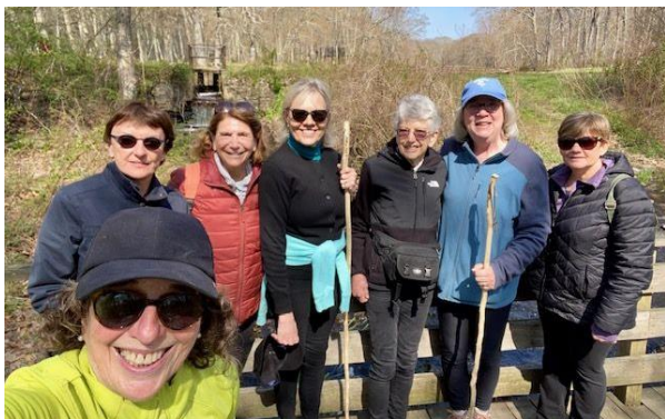
Members hiking Old Town Park, Old Saybrook, in April.