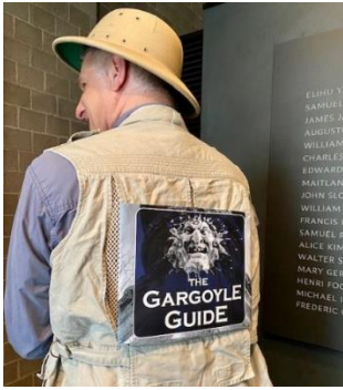
April Cultural Trip – Yale Tour Guide