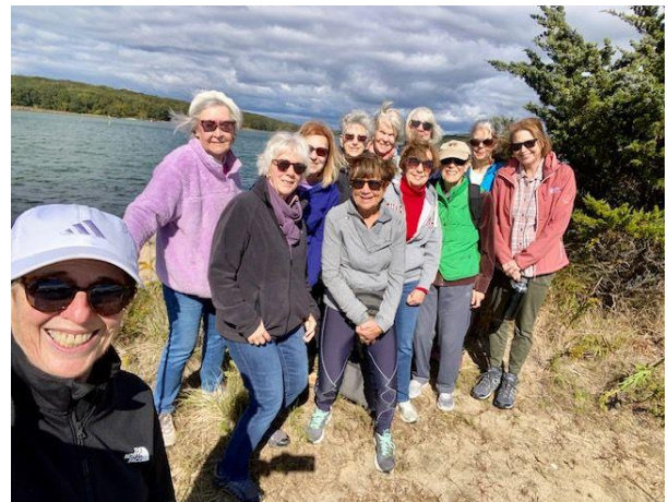
Hiking Group at Long Point, Groton, in October.