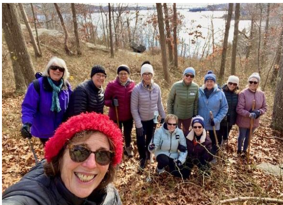
Hiking Group : Mamacoke Island in Quaker Hill, December 2023. (all photos)