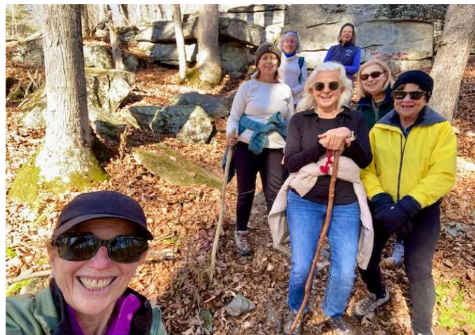
November Hike at Chatfield Hollow State Park in Killingworth

The team will take over and approach for sponsorships! Using your name makes a big difference -- and we'll do the work. Thanks!