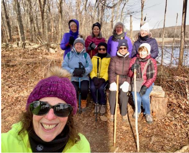
January Hike at The Preserve in Old Saybrook