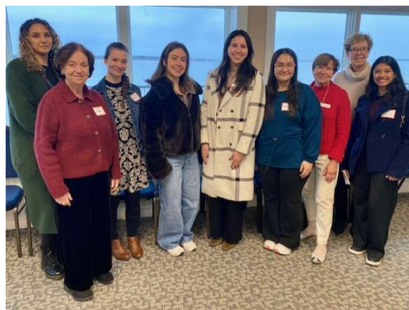
Scholarship Recipients and Committee Members at January Tea

The committee invited the grant recipients to the January Tea, six out of the eight attended. Two recipients brought their mothers, one her father and one her husband. The students shared where they attended school, their major and their goals with the members in attendance. They then received a check for the second half of their grant for the spring semester. It was a wonderful event. Members enjoyed meeting the students as well as the students's guests.