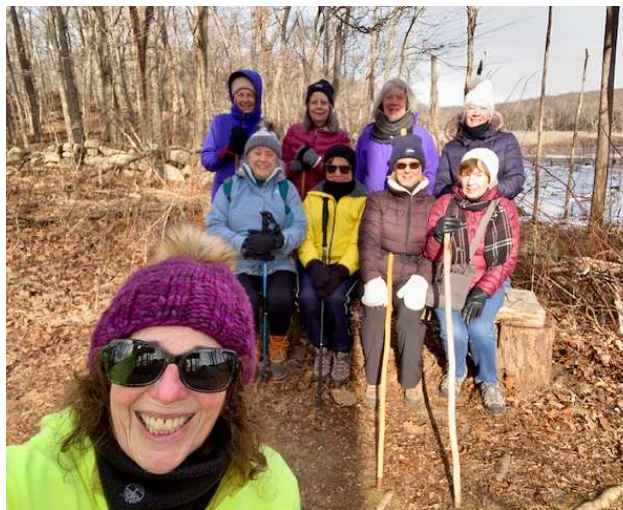
January Hike at The Preserve in Old Saybrook